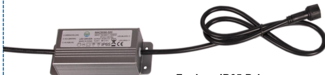
Fanless IP65 Driver