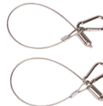
Stainless Steel Hanging Kit